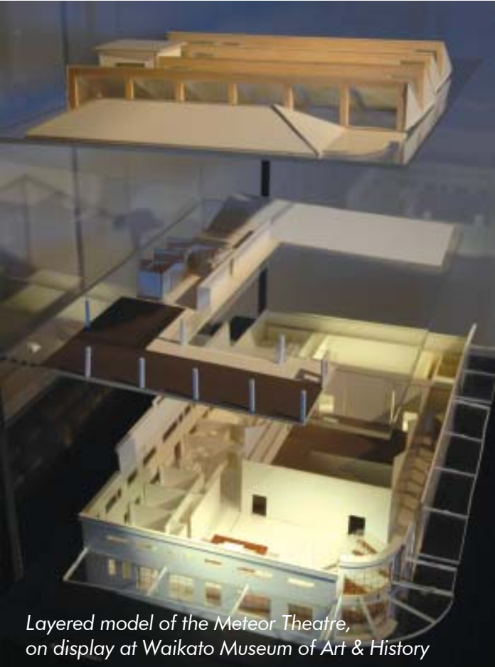
Layered model of the Meteor Theatre, on display at Waikato Museum of Art & History